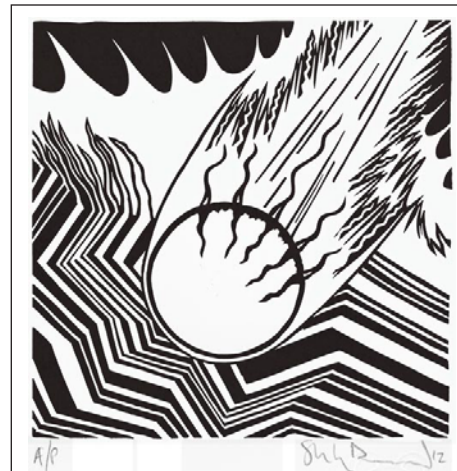
The End (linoprint) Edition of 66