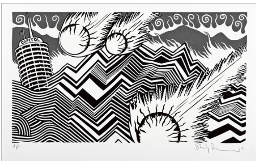
Capitol Meteorite (screenprint) Edition of 199