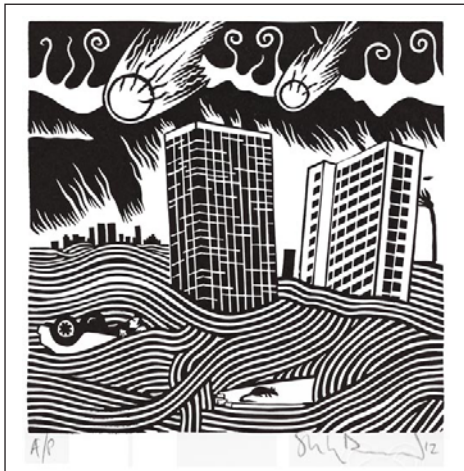
Mondrian (linoprint) Edition of 66