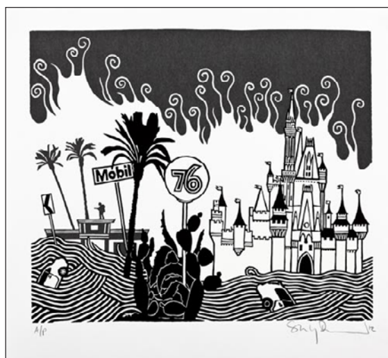
Anaheim Anguish (screenprint) Edition of 199